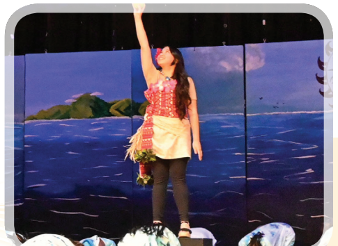
Providing opportunities outside of the school day to develop well rounded students.