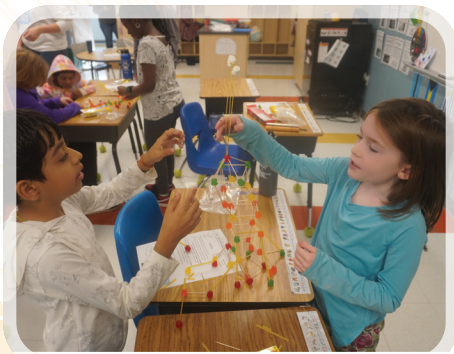
Unique approach to combine literacy skills with STEAM.