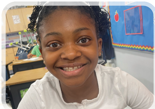
Girls work to advance healthy lifestyle choices.